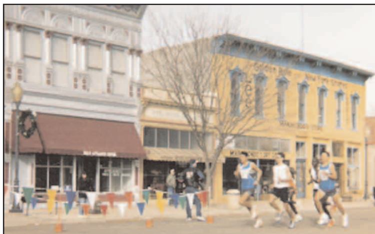
Several runners start the Jingle Bell Run on Raton's historic First Street during a previous run in 2007.

The run has always been held at night until the past