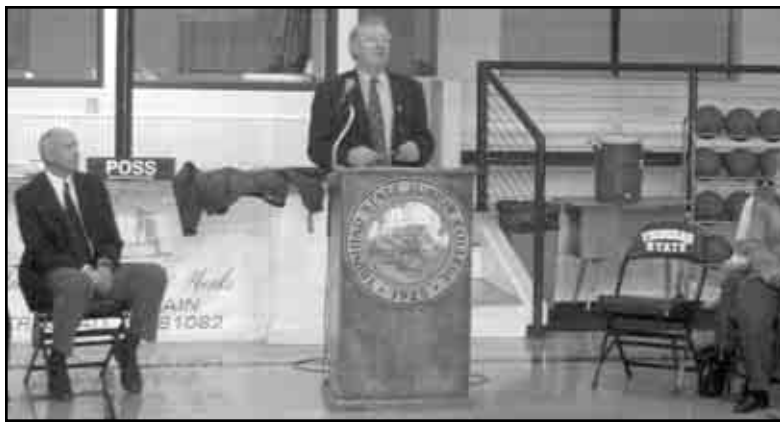
The coach gets a little emotional, thanking everyone who has helped him along the way.