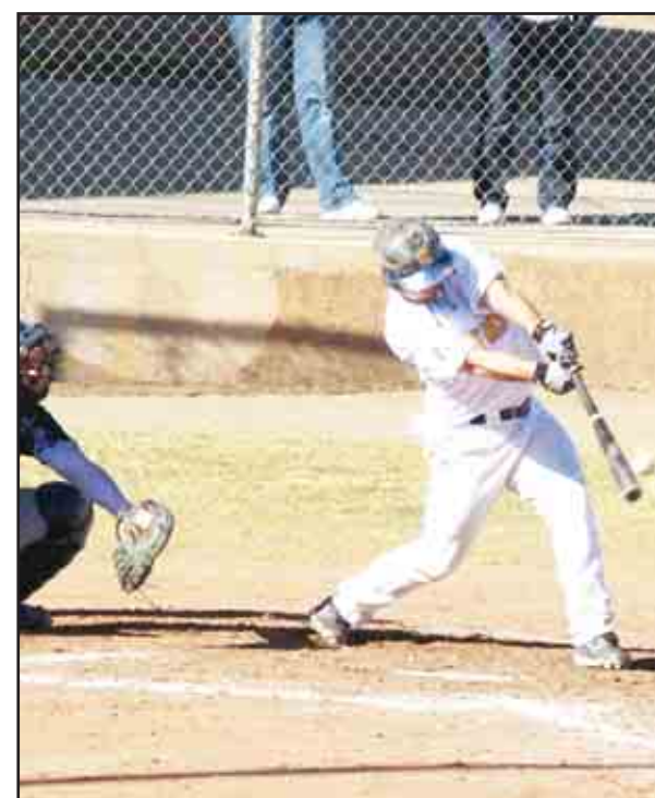
The Trojans hit the ball hard all weekend against Western