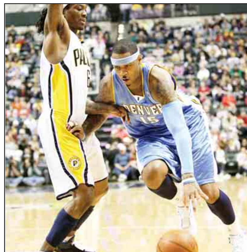
Denver Nuggets forward Carmelo Anthony, right, drives around Indiana Pacers guard Marquis Daniels in the first half of an NBA basketball game in Indianapolis, Sunday, March 1, 2009. Anthony was fouled on the play.

An e-mail seeking comment was sent to Anthony's agent,