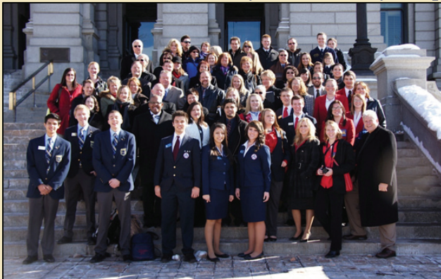
Day at the Capitol participants gather on the steps of the Colorado State Capitol.

Colorado General Assembly Unanimously Adopts Resolution Honoring Colorado CTE